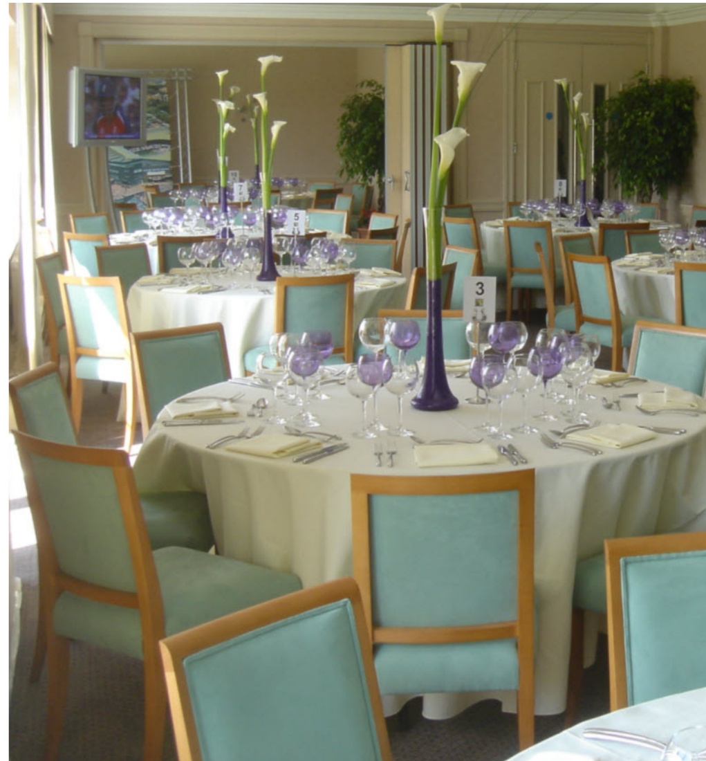
The main dining room at the Clubhouse.