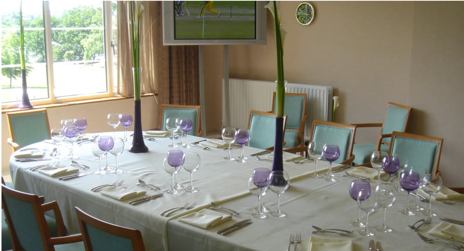
One of the private dining rooms available for twelve or more guests.