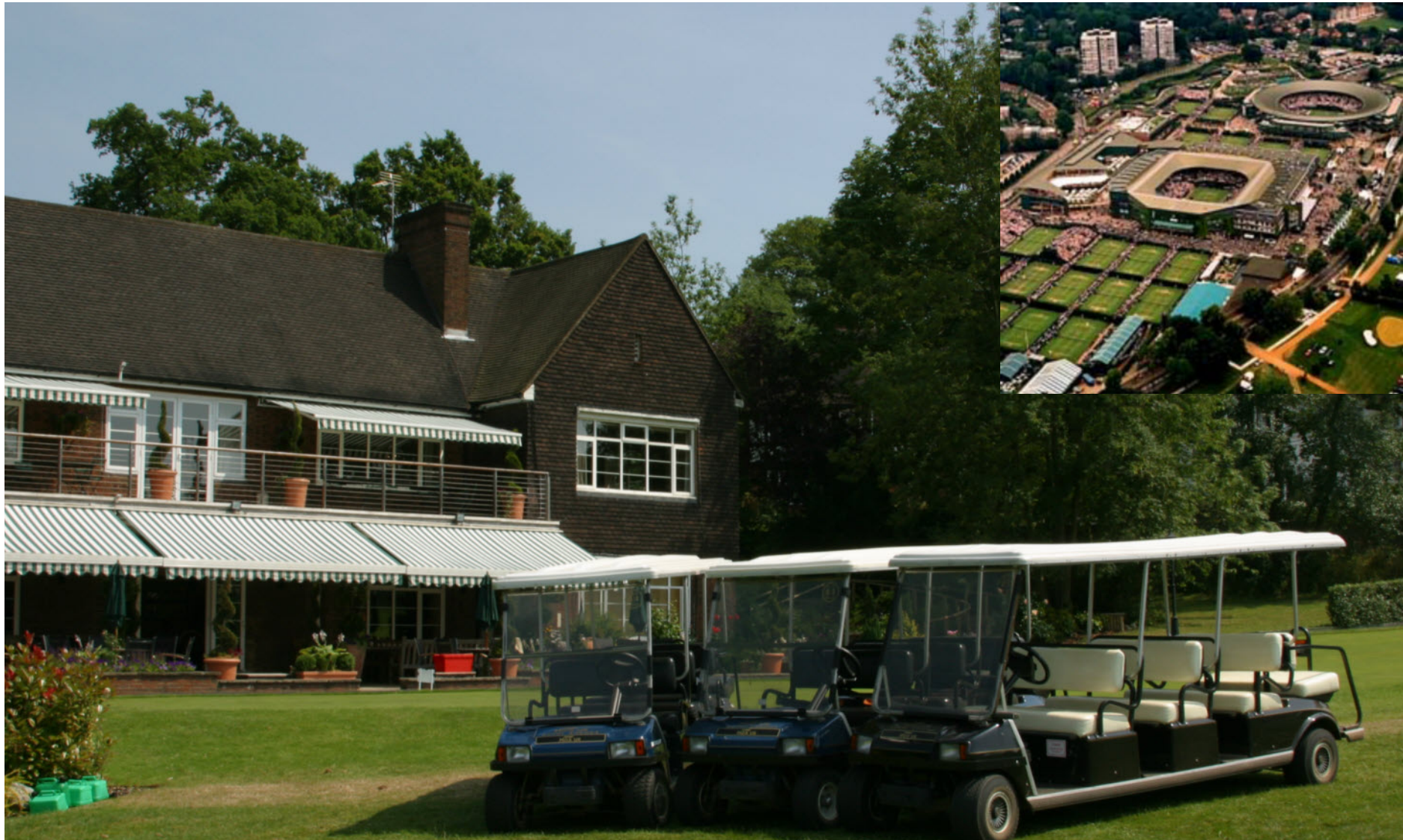
Guests are driven in our buggies between the Clubhouse and the golf course entrance. Directly opposite is the entrance to the All England Club.