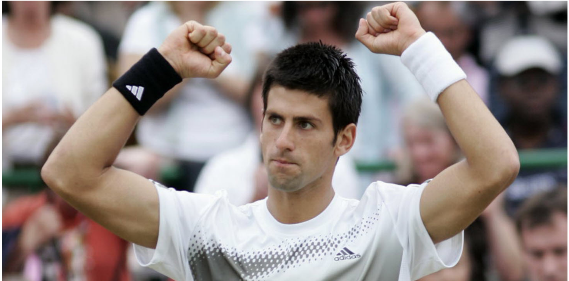
Novak Djokovic - Wimbledon Grand Slam Winner 2011